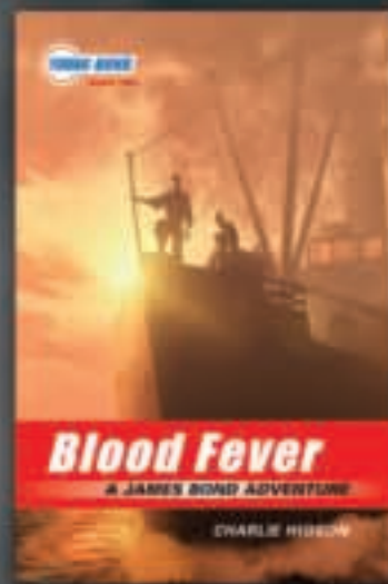
BLOOD FEVER A James Bond Adventure

Following his adventures in the Scottish Highlands, James Bond is back at Eton, where he has joined the risk-taking Danger Society. But all is not as it appears. As a young girl's life hangs in the balance, it's up to James to uncover an intricate conspiracy that will take him head-to-head with enemies more ruthless than he could have ever imagined.