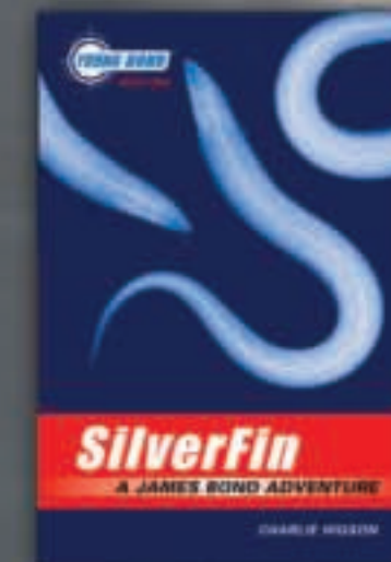
SILVERFIN A James Bond Adventure

The thrilling prequel to the James Bond dynasty shows young James at boarding school at Eton in the 1930s, where he spent his formative years.